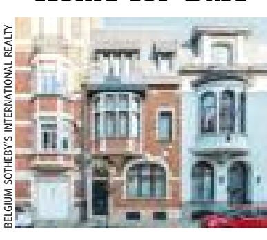
$2.67 million Ixelles-Brugmann Five bedrooms, three bathrooms

This 4,400-square-foot 1936 town-house has a library in its master suite. Agent: Bertrand de Moffarts, Belgium Sotheby's International Realty